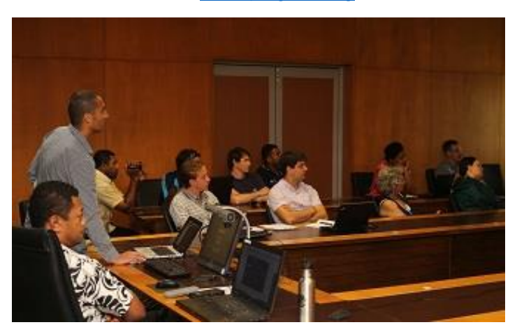
Figure 2 Workshops are held on the Friday of the conference week.

Workshops are held on the Friday of the conference week for registered participants to take part in. Details regarding these workshops will be released closer to the conference date, please signup to GIS PacNET or check <a href="https://www.picgisrs.org">www.picgisrs.org</a> for more information.